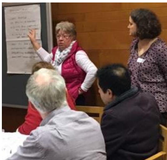
Workshop participant feeding back after an activity at the 'Identifying research priorities' workshop in January 2019

A total of 87 individuals registered to attend one or more workshop. Attendance at each workshop varied from 16 – 34 people. A few people attended all 8 workshops.