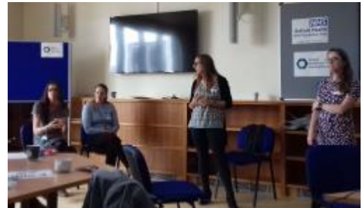
Staff from the NIHR Oxford cognitive health Clinical Research Facility presenting at the 'Carrying out a research study' workshop in April 2019

The average cost for a workshop was £885 (this figure does not include the cost of paying volunteer members for their time in planning the events).