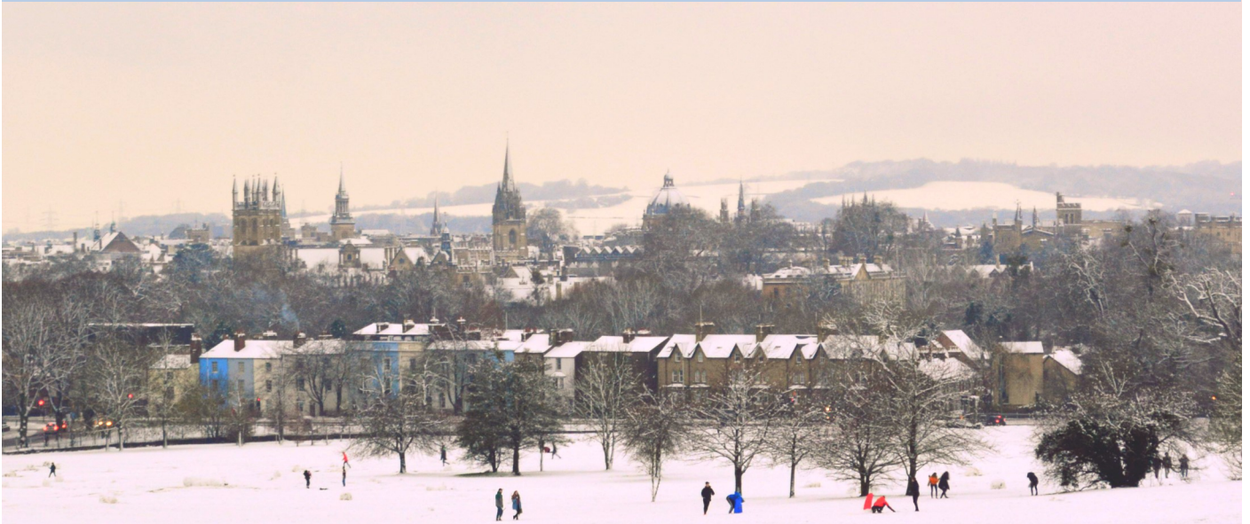
Oxford Skyline in the Winter.