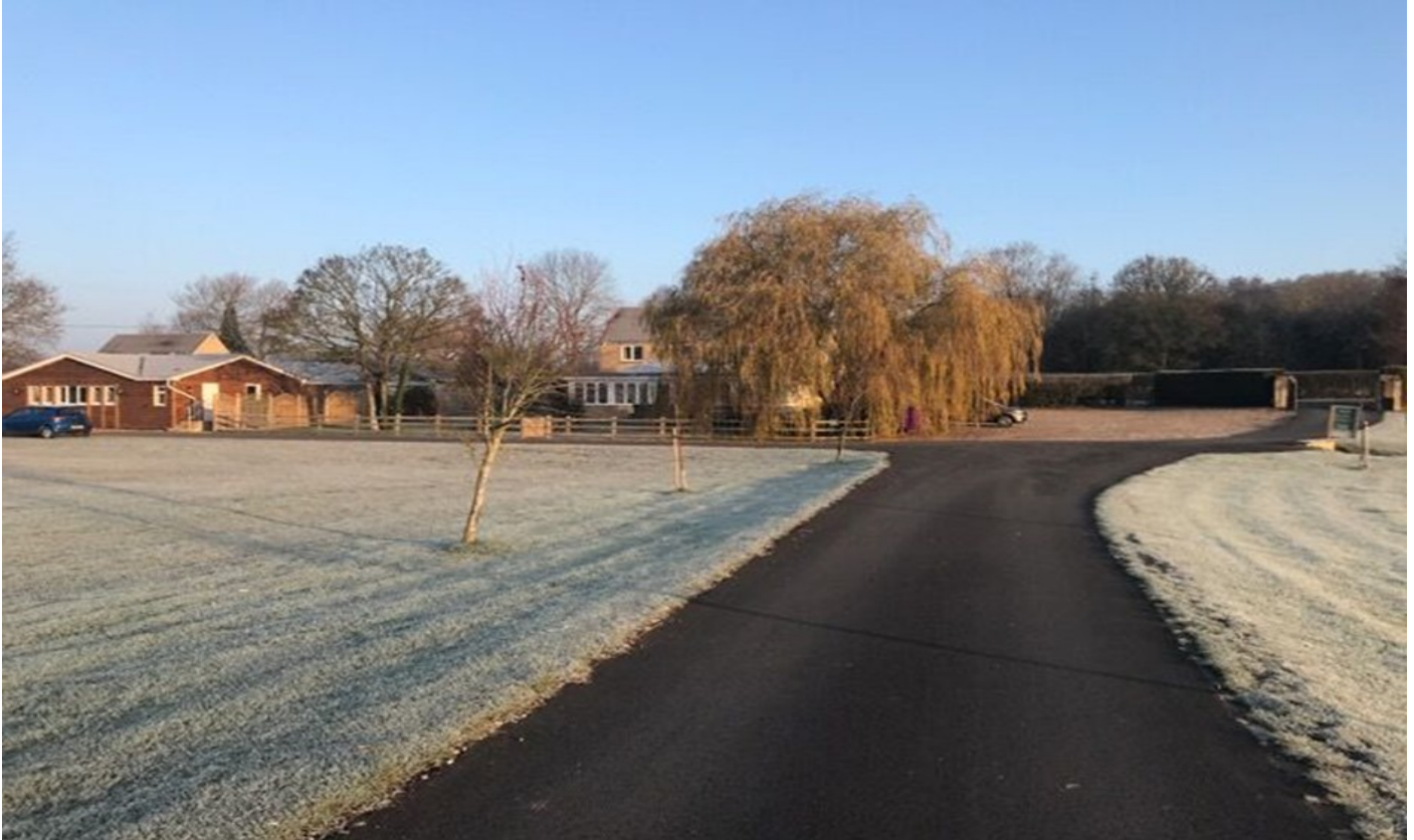
The Cotswold Manor Estate.

Please get in touch with contributions you would like to see published in this newsletter at OxDARE@psych.ox.ac.uk